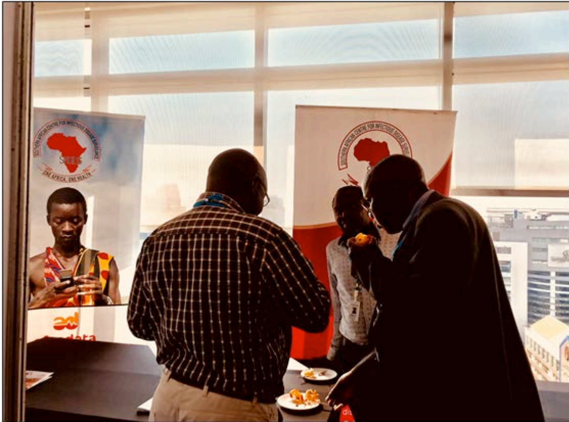
Members of SACIDS

In 2009 SACIDS in collaboration with Imperial College and the Royal Veterinary College (RVC), SACIDS used EpiCollect to map human and animal health facilities in Ngorongoro and Kibaha in Tanzania.