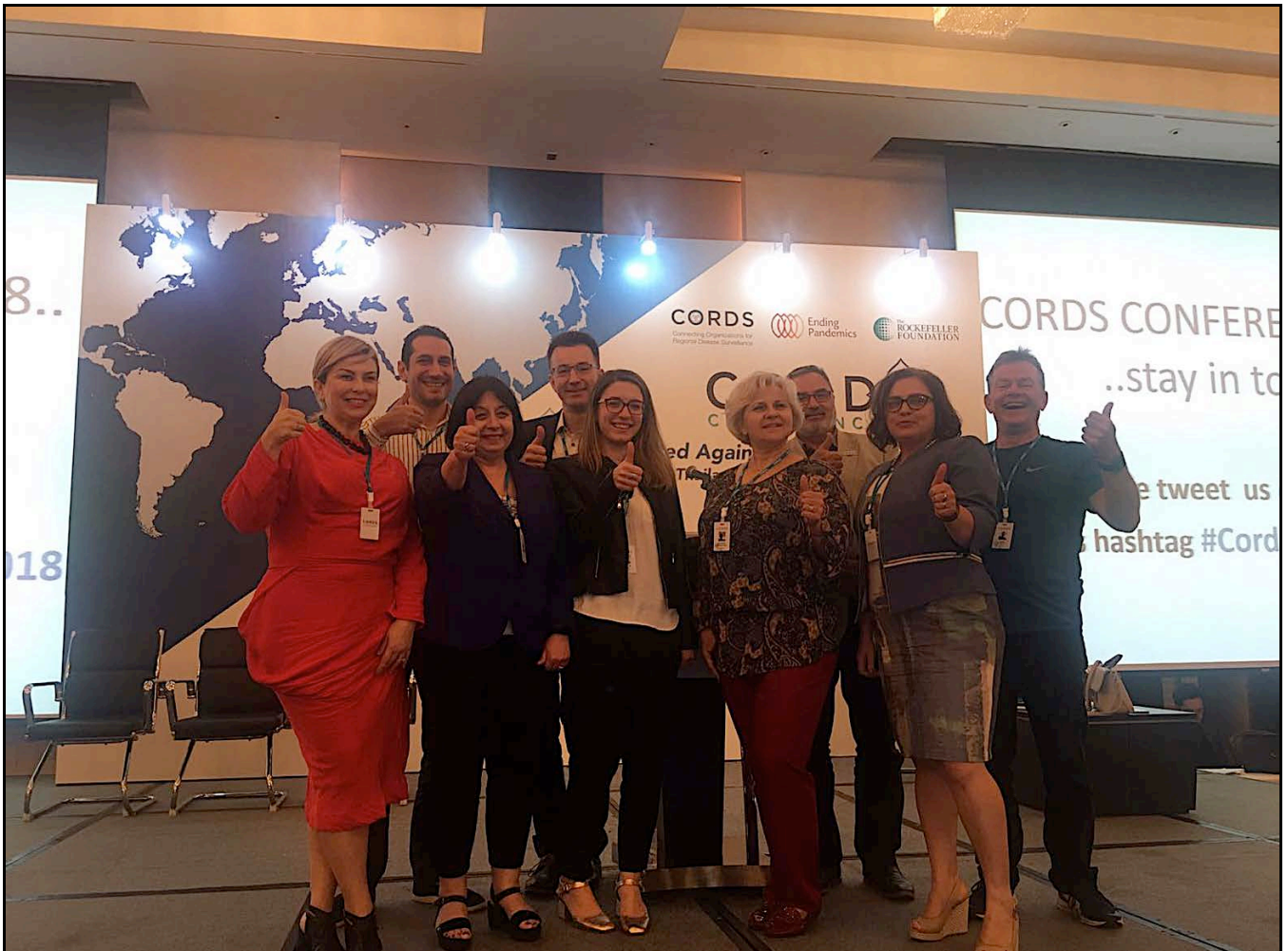
Members of SECID