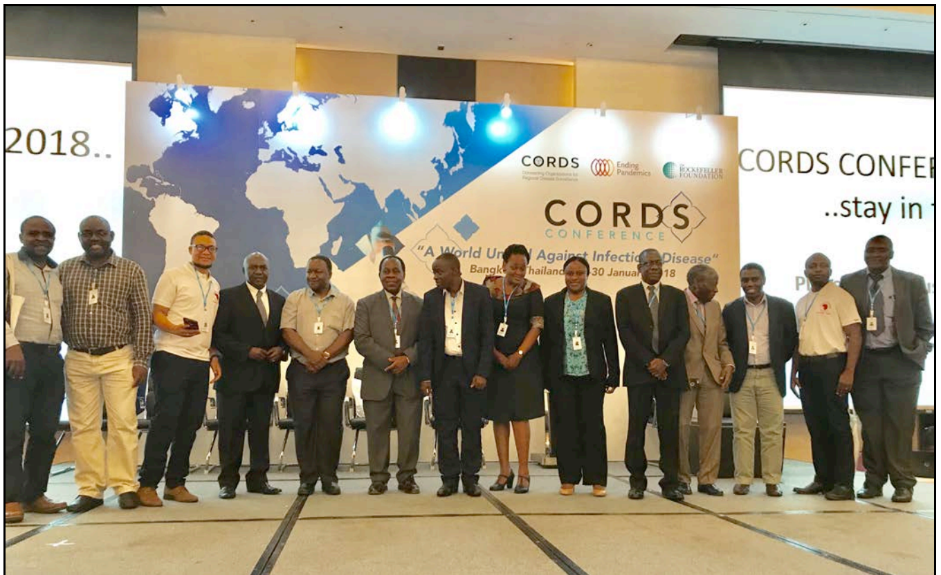
Members of the SACIDS and EAIDSNet Networks