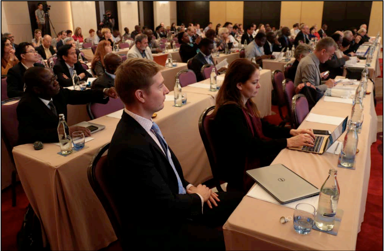
Participants during the CORDS Conference