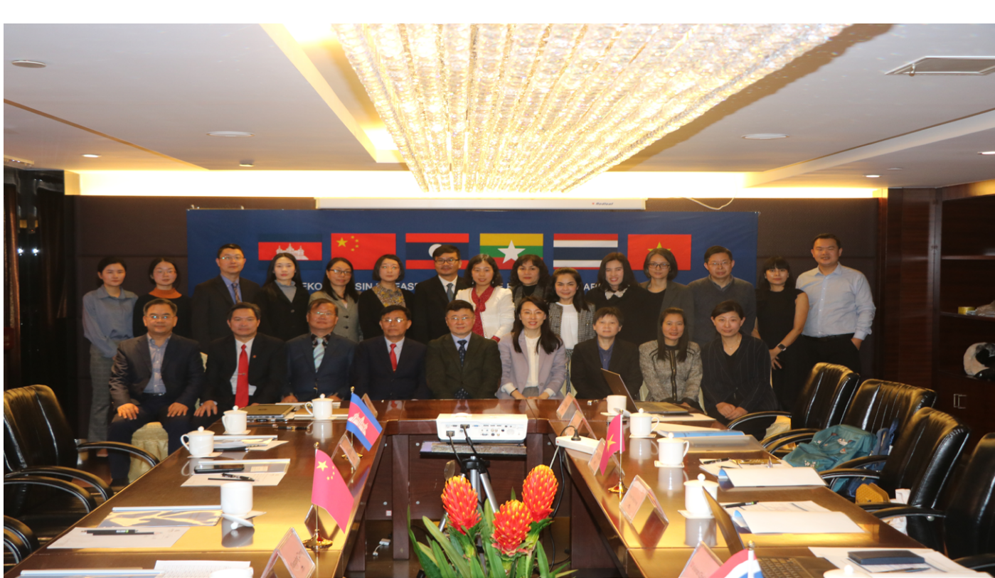
Executive Board and representatives from Cambodia, China, Lao P.D.R, Thailand, Vietnam and MBDS Secretariat