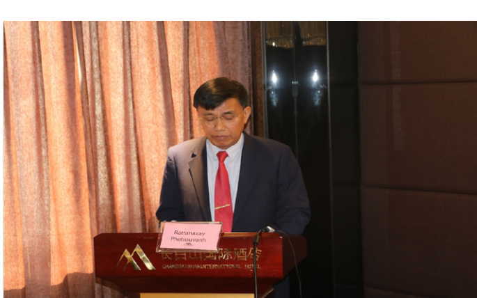
New MBDS Chair from Lao P.D.R giving the remarks