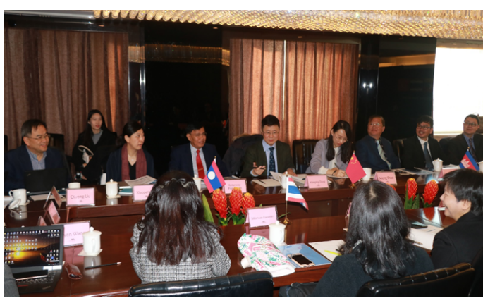
Discussion among MBDS Executive Board member