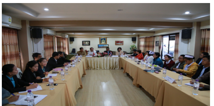
MBDS Cross Border Coordinator from Chiang Rai Provincial Health Office (Thailand) participated in the "Workshop for improving the capacity of public health officials in parallel border on referring to infection in the hospital for taking care AIDS and TB patients" in Chiang Rai Province, Thailand on 17 - 18 February 2020.