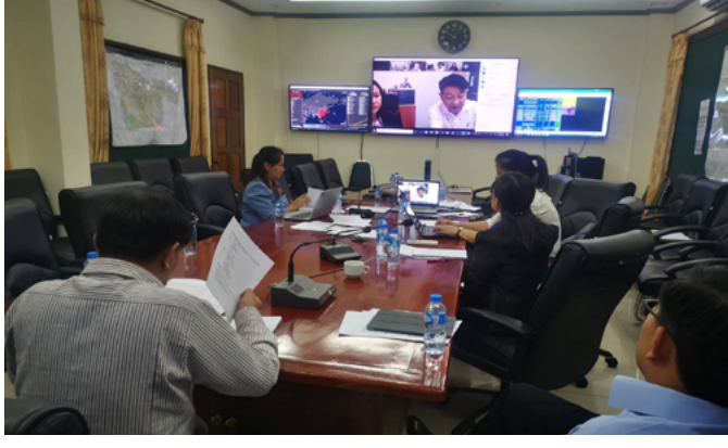
Ministry of Health, Lao P.D.R