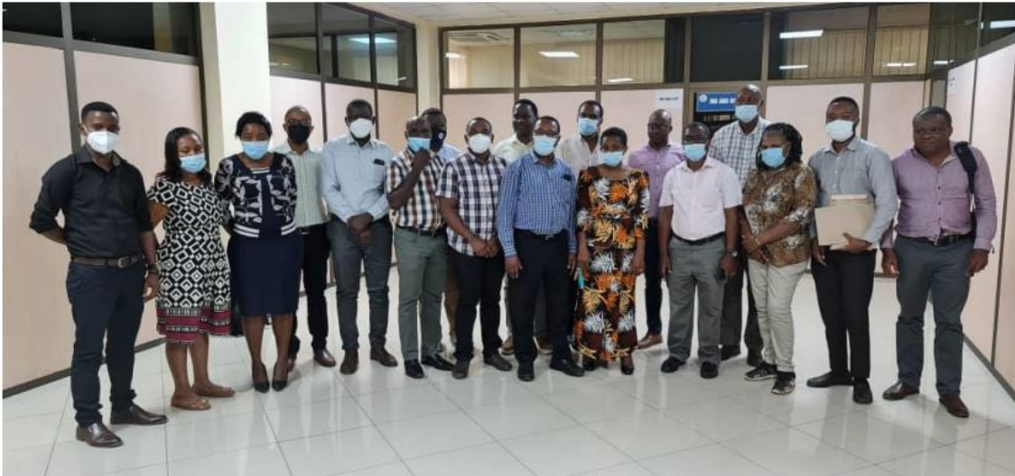
Image: Group photo PARSE national meeting, Tanzania, 1 July 2021.

https://drive.google.com/drive/mobile/folders/1kDtDaMNK0_zsYMf_x9BSAbwFNT1odel?usp=sharing